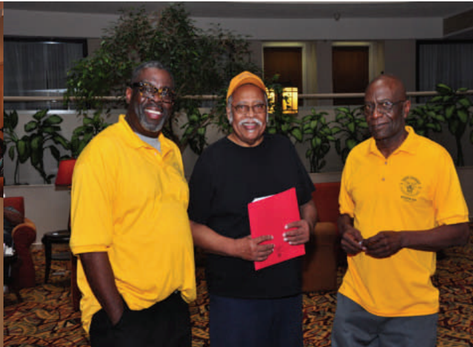
T-shirts, Caps and Pictures on DVD for sale; see website.