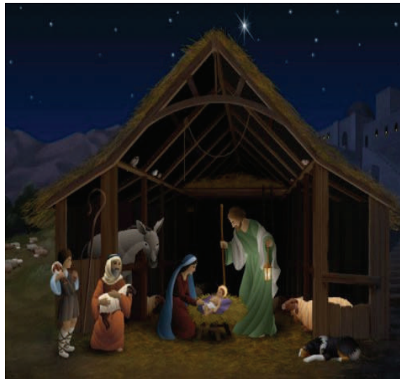
"Jesus! Jesus! O what a wonderful Child."

"Christmas—that magic blanket that wraps itself about us, that something so intangible that it is like a fragrance.