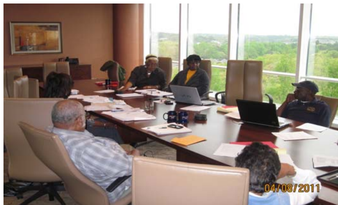
Friday afternoon session in our new office space