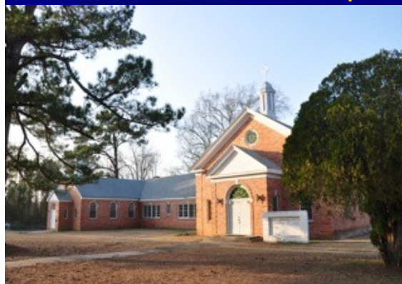
John I. Blackburn Presbyterian Church on the Boggs Academy campus, Keysville, GA—closed

I am sure that the picture of John I. Blackburn Presbyterian Church will evoke memories of years past. Some of us remember “church” as a place where something mysterious and wonderful happened. For most of us, this God who was everywhere and knew everything was too much for us to grasp; yet we felt the church was a warm and safe place to be. In church we heard Bible-based sermons and great choral music. For some, the church was a very uncomfortable place to be, even with caring adults and friends close by. No matter what we felt or thought, we all left John I. Blackburn each Sunday morning with memories that continue to impact our lives. If the walls of this church could talk, I wonder what they would say about the hundreds of students who sat in her pews?