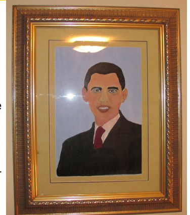
A portrait of President Barack Obama